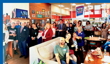
Monthly Networking Events